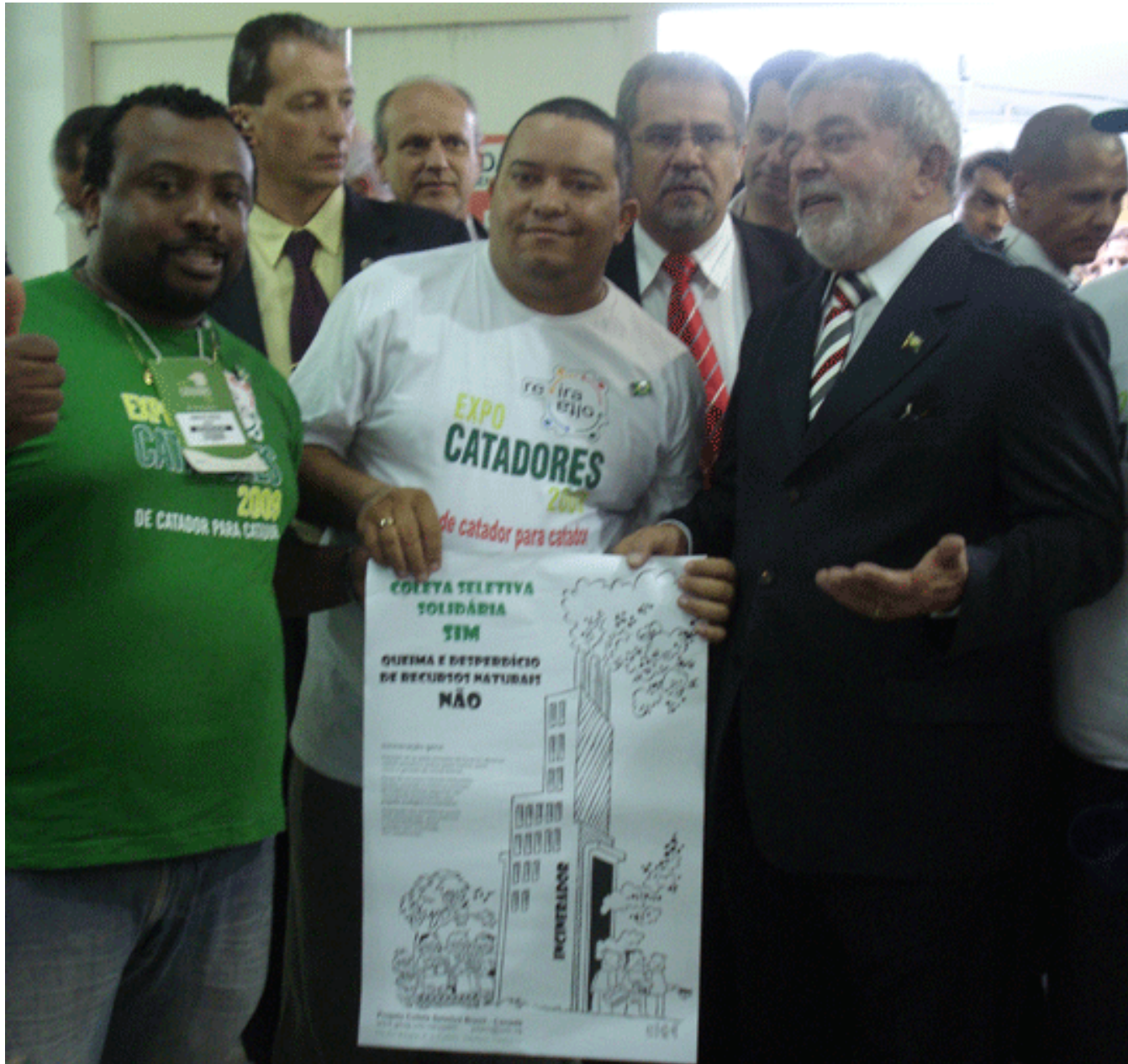
President Lula with Brazilian Catadores - 2009