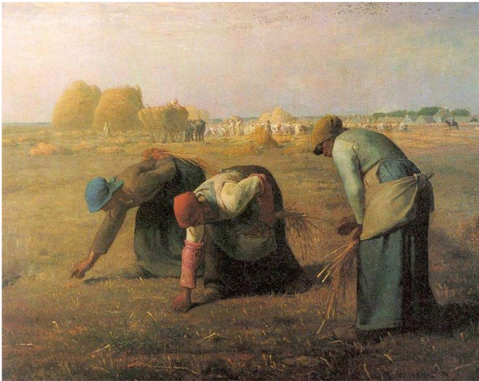
Gleaners by Francois Millet, 1857